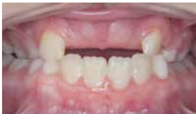
Outline of the maxillary central incisors seen beneath the gingiva

In preparation for orthodontic care, the incisal edges were uncovered using topical anesthesia and a diode laser. On clinical evaluation three months later, the tissue was well-healed, but the teeth remained unerupted despite the procedure.