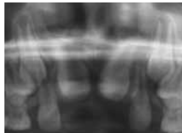
CONVENTIONAL PAN (cropped): Two supernumerary maxillary centrals perfectly occluded by permanent central incisors